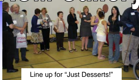
Line up for “Just Desserts!”